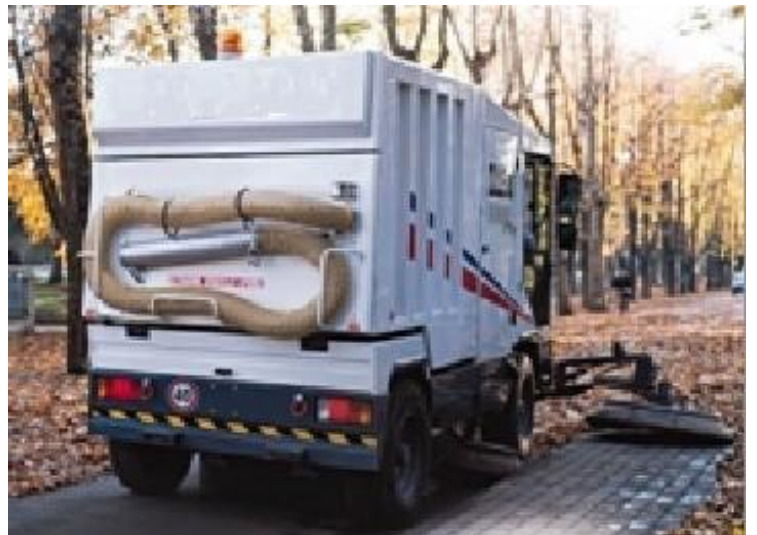
Urban Streets, Rapid Transport Corridors, Airport Peripheral Roads, Highway Corridors, Industrial complex & parks, and Etc