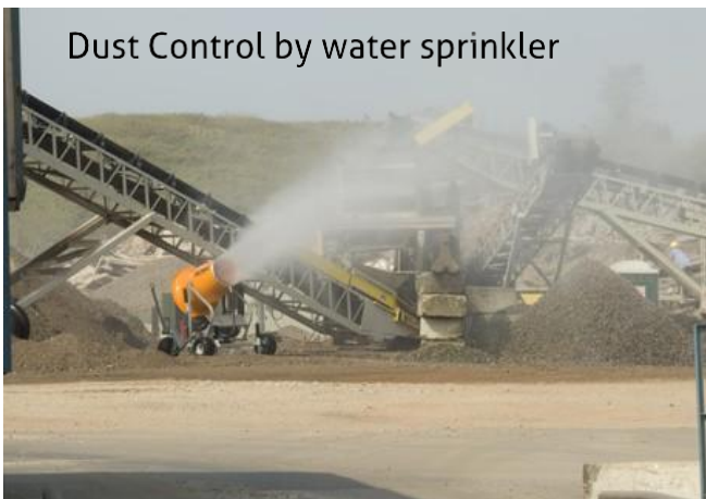
Dust Control by water sprinkler