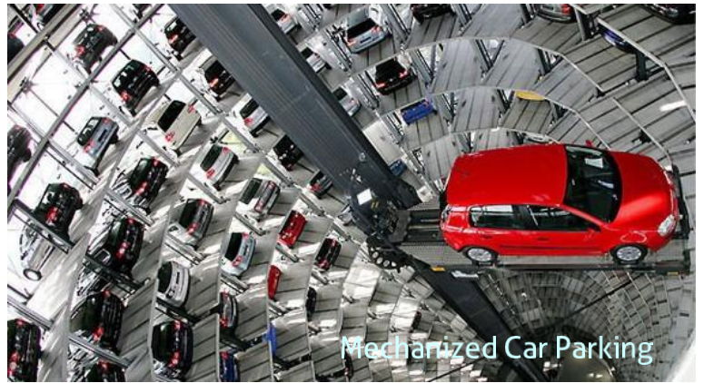
Mechanized Car Parking