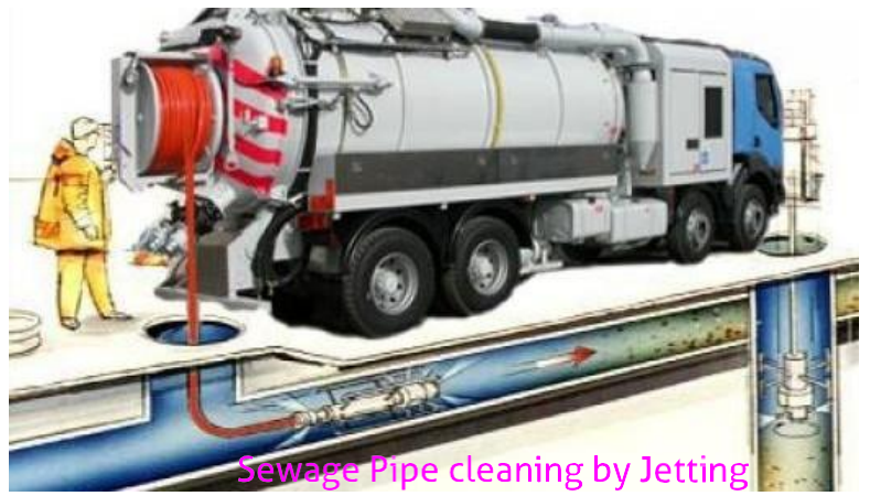
Sewage Pipe cleaning by Jetting