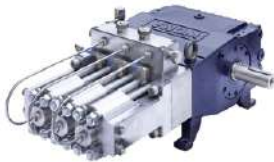
High Pressure Plunger Pump

Max. operating pressure of 4000 bar and max. flow rate of 5.3 l/min