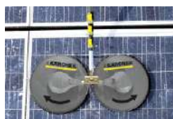
iSolar 800 Solar Panel Cleaning