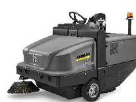
KM 120/250 R D Classic