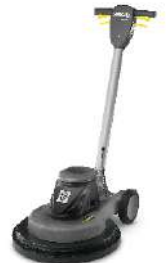
BDP 50/1500 C