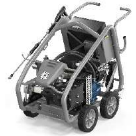
HD 9/100-4 Cage Classic