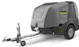
HDS 9/50 De Tr1