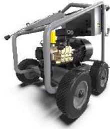
HD 13/35-4 Classic