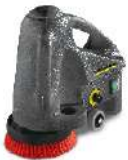
BD 17/5 C