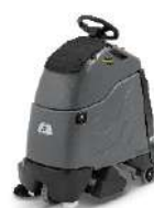
CV 60/2 RS