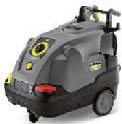
HDS 6/14 C