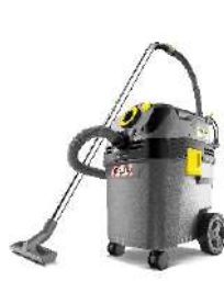
NT 40/1 Ap L