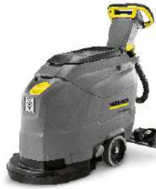
BD 43/40 Classic EP