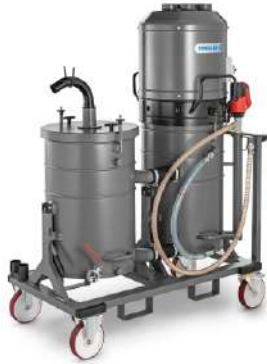
Liquid And Swarf Vacuums