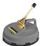
FR 30 Splash Guard