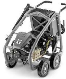
HD 18/50-4 Cage Adv