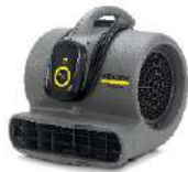
AB 30 Classic