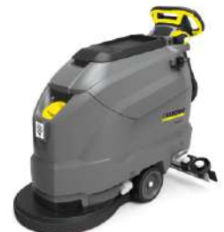
BD 50/50 Classic