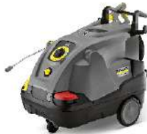
HDS 8/18-4 C