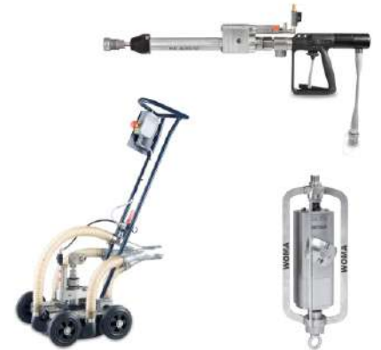
Waterblast Tools and Accessories