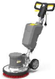
BDS 43/150 C Classic *IN