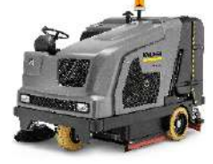
B 300 RI