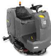
B 90/160 R Classic Bp