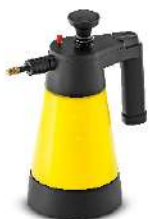
Pump Spray Bottle