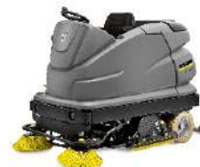
B 250 R Bp