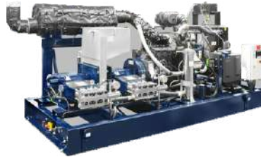
High Pressure Water Jetting Systems

Max. operating pressure of 4000 bar and max. flow rate of 5.3 l/min