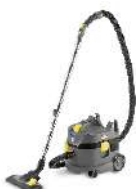
T 9/1 BP