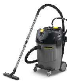
NT 65/2 Ap