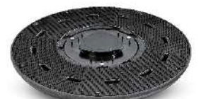
Universal Pad Holder