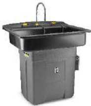
PC 100 M2 BIO