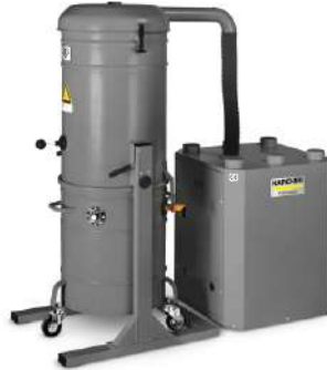
High-performance Industrial Vacuums