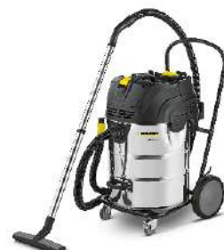
NT 75/2 Ap Me TC