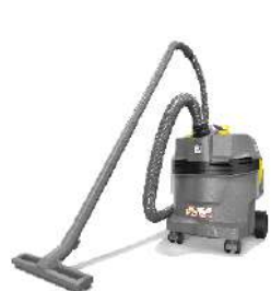
NT 22/1 Ap L