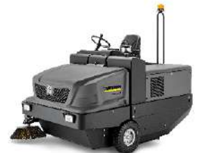
KM 150/500 Classic