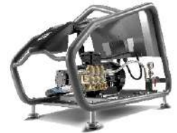
HDCI 30/5-4 ST So-Ex (for Solvent)