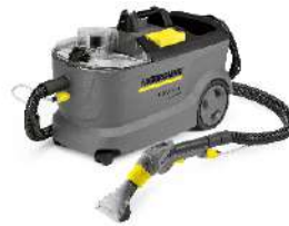
Puzzi 10/1 + Hand *EU