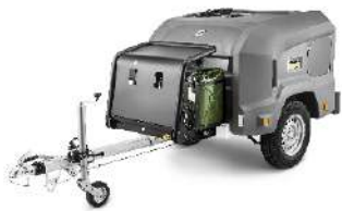
HD 9/23 De Tr1