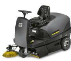
KM 100/100 R P