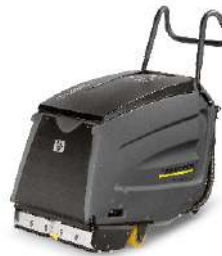
BR 47/35 Esc