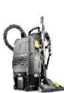
BV 5/1 BP