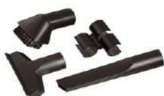
Vacuum Tool Kit