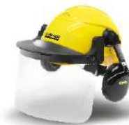
Safety helmet with hearing protection & visor