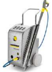
HD 10/15-4 Cage Food