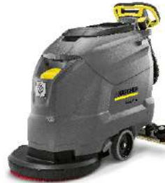
BD 50/60 Classic EP