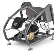
HDCI 30/10-4 ST Dw (for DM Water)