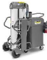
IVS 100/55 M