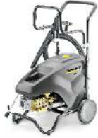
HD 6/15-4 Classic