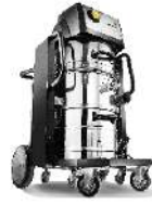
IVC 60/30 Tact2