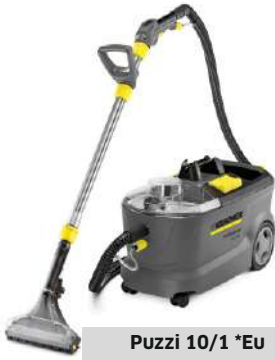
Puzzi 10/1 *EU