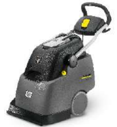
BRC 45/45 C Ep