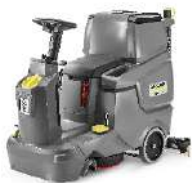
BD 50/70 Bp Classic