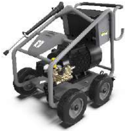
HD 13/50-4 Classic