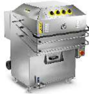
PC 60/130 T