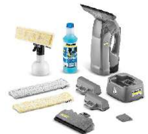
WVP 10 Adv