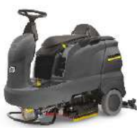
B 90 R Bp