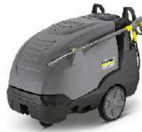
HDS 8/16 - 4 kW - 4 E (12/24/36 kW)