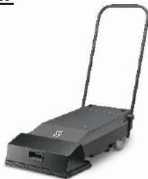
BR 45/10 Esc