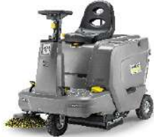
KM 85/50 R Bp