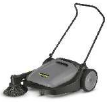
KM 70/15 C