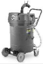
IVR-L 100/24 - 2