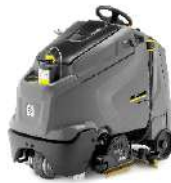
B 95 RS